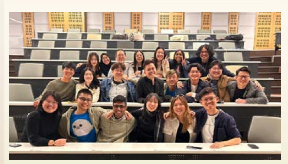
Overseas Merit Fellowship Meeting

For fellow students hesitating to apply, my advice is to take a leap of faith - there is no harm in trying. I was unsure of my suitability and worth in comparison to others, but recognised that applying opens doors to personal growth, skill development, and a step closer to aspirations. While scholarships may be competitive, not trying means missing out on the opportunity to discover one's standing and potential for growth.