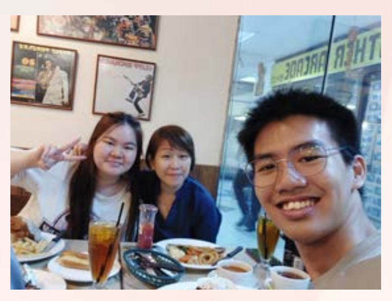
Erudites - Post Event Prep Dinner

Through my CCAs, I discovered profound joy in creating experiences for people that either inspire them or help them with their personal journey. I witnessed firsthand the power of interactive storytelling and development in igniting curiosity and passion.