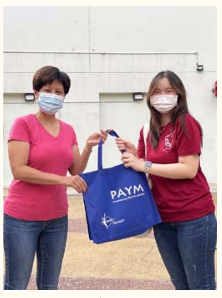
Celebrating Christmas with families living in rental blocks.

Focus and grow at your own pace, in your own style and through your own ways. These are what helps in self-discovery and stand out. Write the chapters that are unique to you.