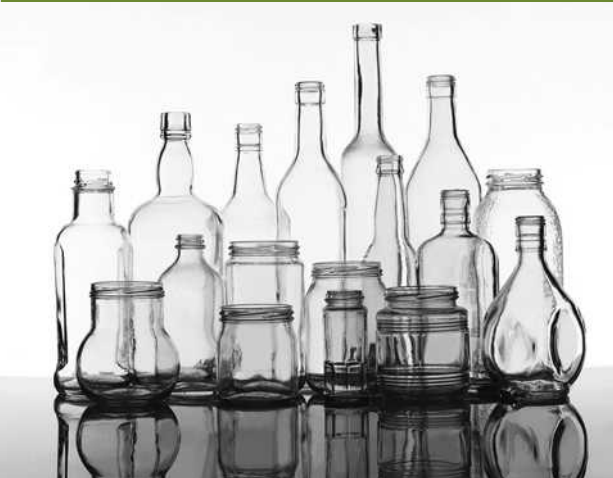
Used glass containers converted to green building material