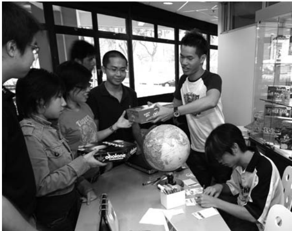
Board Games Zone at the library