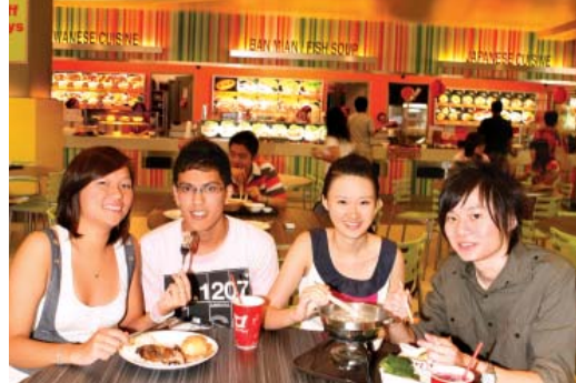
Makan Place is one of three air-conditioned food courts on campus

NP is spread over 35.4 hectares at the fringe of the Bukit Timah residential district.