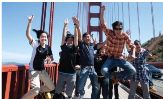
Every Ngee Ann student will get to participate in at least one overseas-based programme