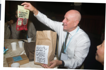
A "tea-break" with worms, meatless jerky and fortified liquid food to challenge thinking about the future of food