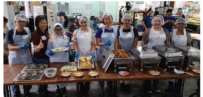
Non-acad colleagues became "hawkers" for a day

Our colleagues gave the experience a thumbs-up! Look out for other such programmes in 2019!