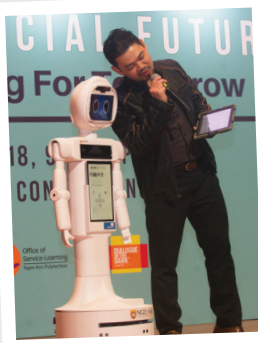
A human-robot hosting segment