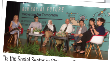
"Is the Social Sector in Singapore Future-Ready?" - a thought-provoking discussion