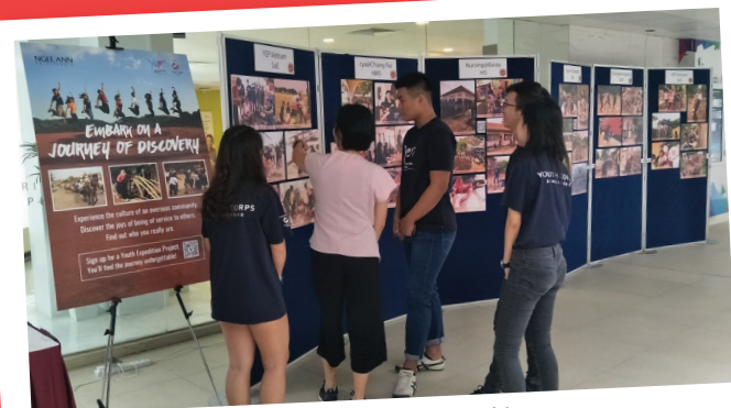
YEP Showcase of 12 trips to 4 countries